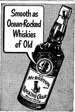
lended Whiskey-80.6 Proof-70% Grain Neutral Spirits Mr. Boston Distiller Inc., Boston

"Ma said nobody did call," said Coffman. "Someone called the hotel. If you're going to frame a man for murder, you have to make [Turn page]